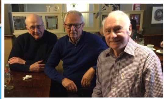
The "Derby crew" having a great time together!