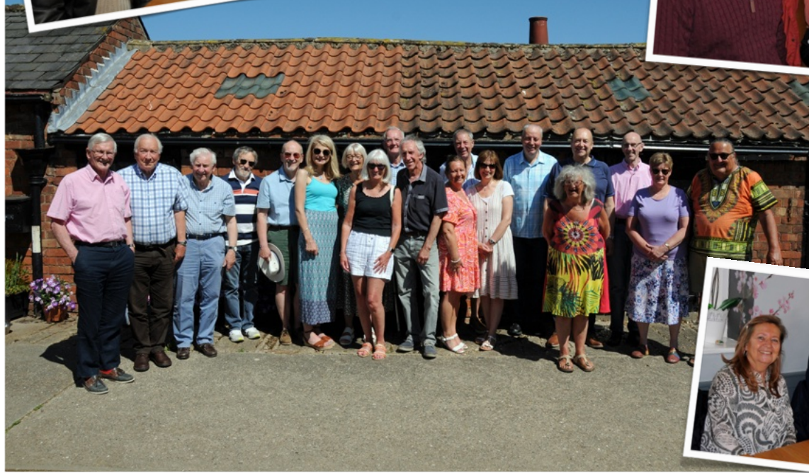
The group photo shows the attendees at the glorious June get-together with the smaller photos from the April event.